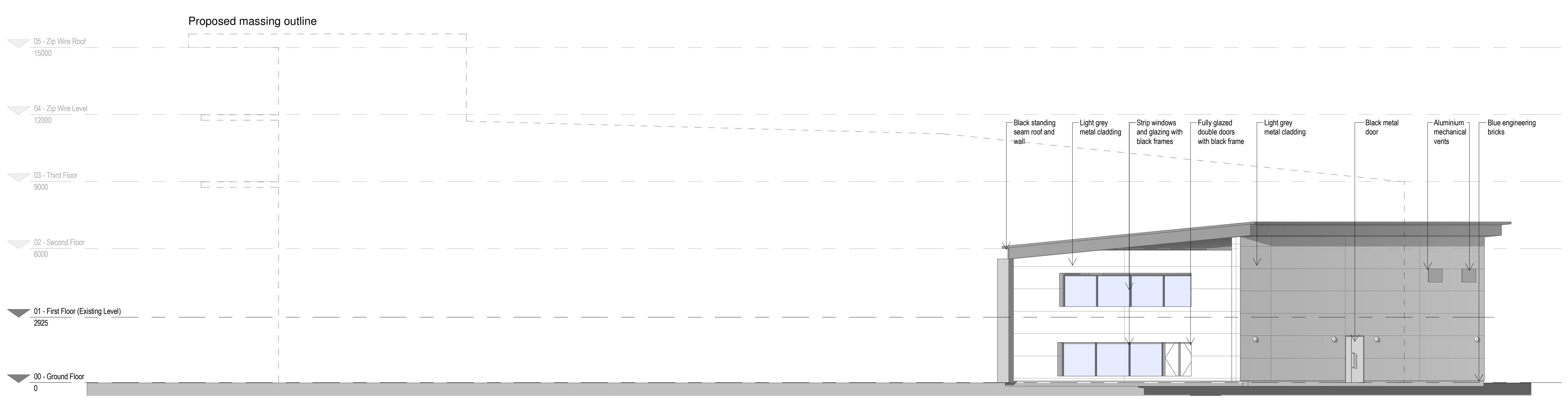
Existing Elevation 2