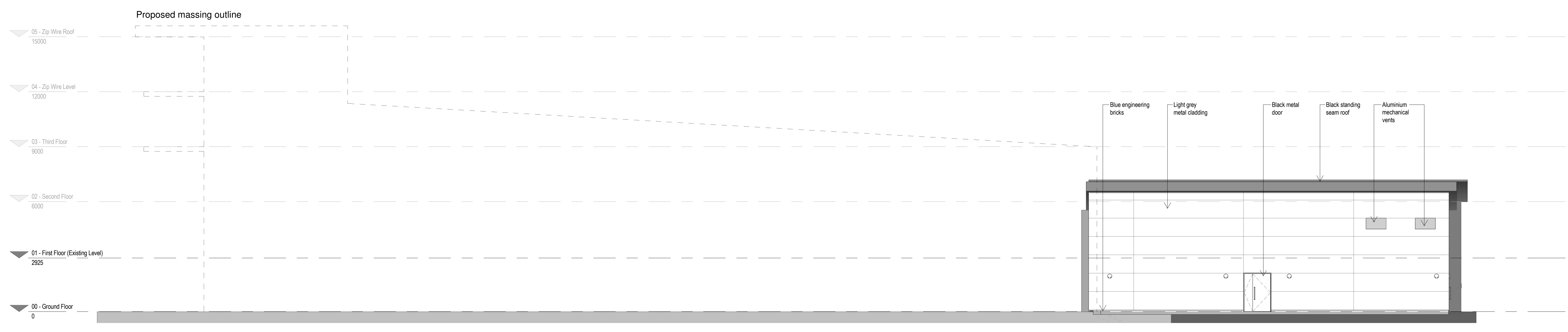
Existing Elevation 1